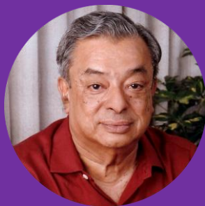
Dr. Verghese Kurien

A quarterly newsletter of Anandalaya, Jul 2019 - Oct 2019 : Issue - 9